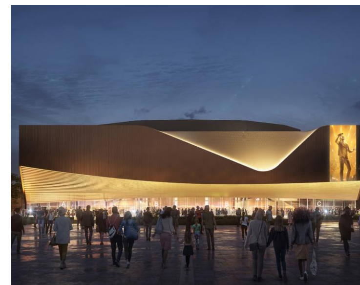
Images: CGI photos of Cardiff Arena & Hotel